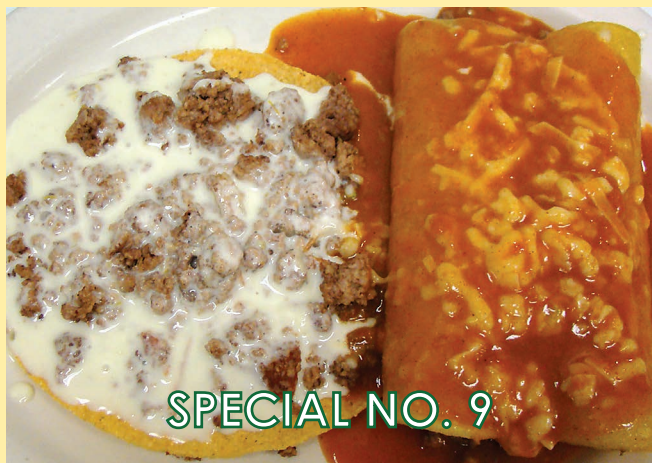
SPECIAL NO. 9

Coke, Diet Coke, Sprite, Dr. Pepper, Root Beer, Ginger Ale, Ice Tea, Lemonade, Coffee, Milk, Cranberry or Apple Juice