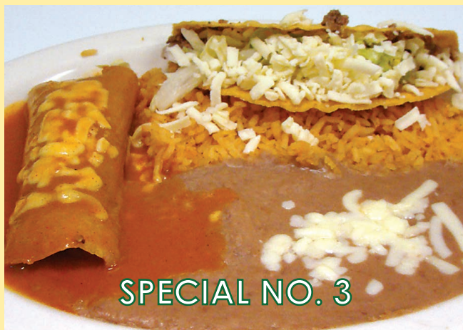
SPECIAL NO. 3